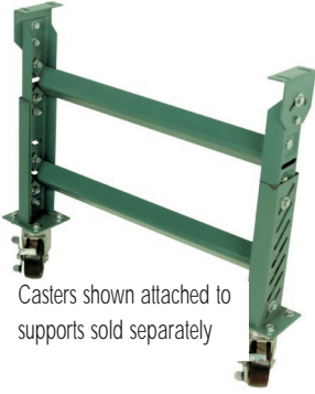
Castors shown attached to supports sold separately