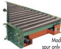
Model 796LSSOX, spur only with powered crossover, shown above.

SPECIFY MODEL NUMBER PER EXAMPLE 796LSS-45-21-R 796LSS (spur degree)-(between frames)-(left or right) Available in 30° or 45°. Specify 796LSSO for spur module only less mainline module (similar to photo below).