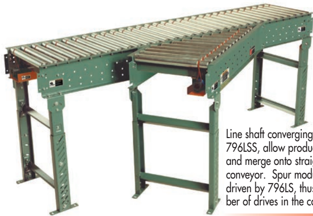
Conveyor shown with optional supports

Line shaft converging spur modules, model 796LSS, allow product to flow from spur lines and merge onto straight line shaft driven conveyor. Spur modules are designed to be driven by 796LS, thus decreasing overall number of drives in the conveyor system.