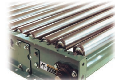
POP-OUT ROLLERS (some rollers raised for clarity)

starter (one direction or reversible); One direction manual starter; Momentary start/stop push button station; For-ward/reversing /stop push button station. Mounting and pre-wiring for units up to 12' long.