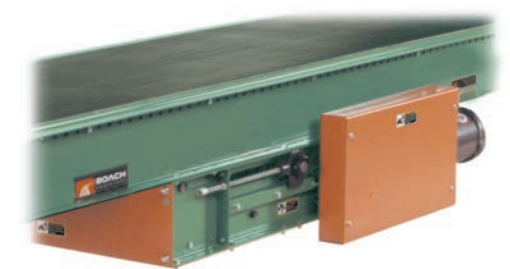
OPTIONAL CENTER DRIVE