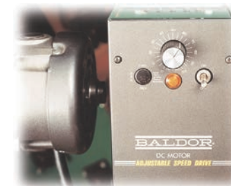
OPTIONAL DC VARIABLE SPEED CONTROLLER

ELECTRICAL CONTROLS: Magnetic starter (one direction or reversible); One direction manual starter; Momentary start/stop push button station; Forward/reversing /stop push button station. Mounting and pre-wiring for units up to 12' long.