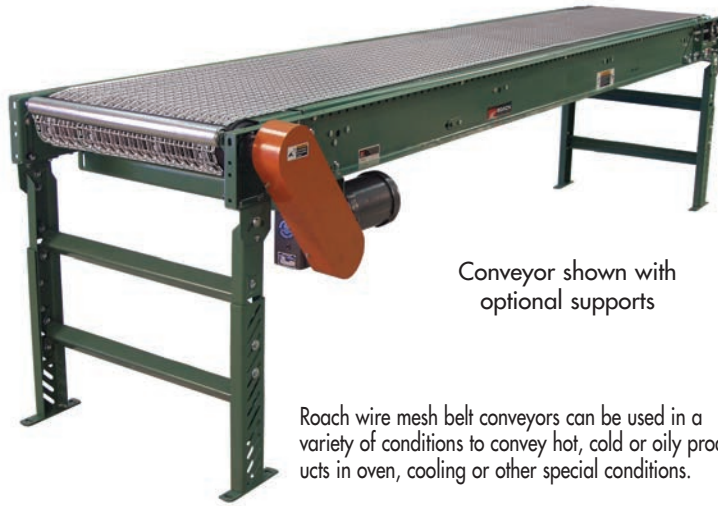
Conveyor shown with optional supports

Roach wire mesh belt conveyors can be used in a variety of conditions to convey hot, cold or oily products in oven, cooling or other special conditions.