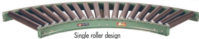
Single roller design