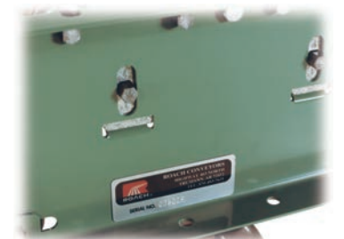
CALR CAM AND SERIAL PLATE

ELECTRICAL CONTROLS: Magnetic starter (one direction or reversible); One direction manual starter; Momentary start/stop push button station; Forward/reversing/stop push button station. Mounting and pre-wiring for units up to 12' long.