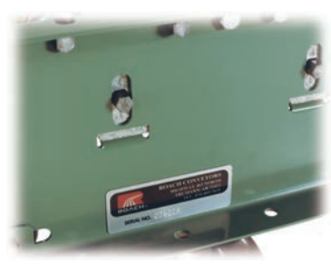
CALR CAM AND SERIAL PLATE

ELECTRICAL CONTROLS: Magnetic starter (one direction or reversible); One direction manual starter; Momentary start/stop push button station; For-ward/ reversing / stop push button station. Mounting and pre-wiring for units up to 12' long.