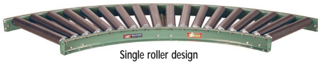
Single roller design