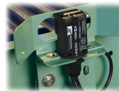
PHOTO SENSOR MOUNT

DEFUSED SMARTZONE: Photoeyes mounted below tread rollers.