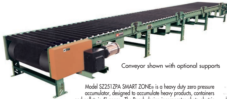
Conveyor shown with optional supports

Model SZ251ZPA SMART ZONE® is a heavy duty zero pressure accumulator, designed to accumulate heavy products, containers and pallets in 5' zones. The Roach design incorporates photo electric sensors instead of sensor rollers, eliminating many common problems associated with conveying wooden pallets. Products do not touch during accumulation and are singulated individually off of conveyor. Heavy loads weighing up to 3000 lbs. may be safely accumulated with Roach SMART ZONE®.