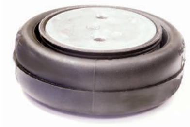
HEAVY DUTY AIR BAG