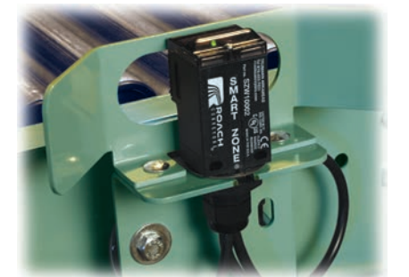
PHOTO SENSOR MOUNT

DEFUSED SMARTZONE: Photoeyes mounted below tread rollers.