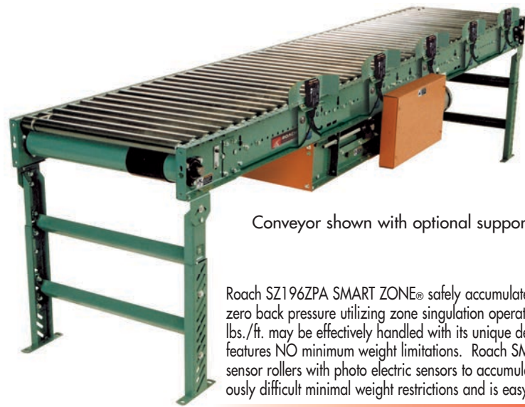
Conveyor shown with optional supports

Roach SZ196ZPA SMART ZONE® safely accumulates packages with zero back pressure utilizing zone singulation operation. Loads up to 125 lbs./ft. may be effectively handled with its unique design. This conveyor features NO minimum weight limitations. Roach SMART ZONE® replaces sensor rollers with photo electric sensors to accumulate products with previously difficult minimal weight restrictions and is easy to install.